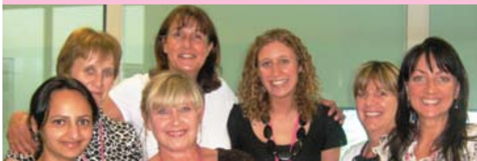
The Genesis Appeal's Fundraising Team.

Staff and volunteers gathered at the Nightingale Centre and Genesis Prevention Centre to celebrate one year of exceptional patient care and pioneering research into the prevention of breast cancer.